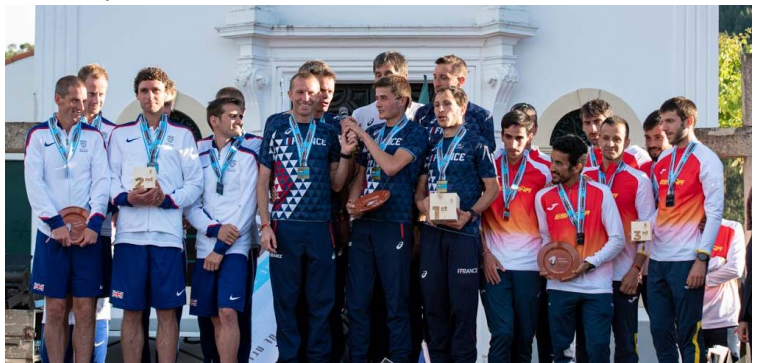
Men team podium – TWC 2019 1<sup>st</sup> FRANCE, 2<sup>nd</sup> GREAT BRINTAIN, 3<sup>rd</sup> SPAIN